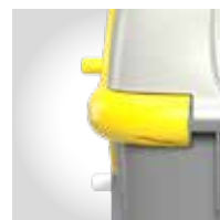
YELLOW RAL 1018