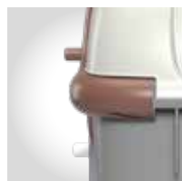
BROWN RAL 8024