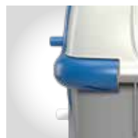
BLUE RAL 5005