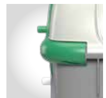
GREEN RAL 6032

Colours may vary due to production. The colour values given according to RAL are guide colours.