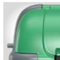
GREEN RAL 6032