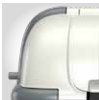
GREY RAL 7038