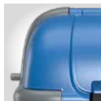
BLUE RAL 5005