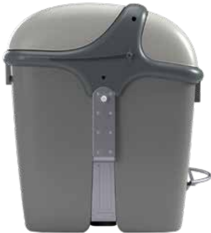
GREY RAL 7037