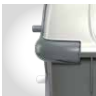
DARK GREY RAL 7011