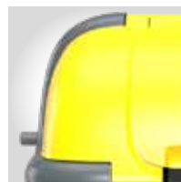
YELLOW RAL 1018