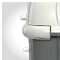
LIGHT GREY RAL 7038