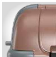
BROWN RAL 8024