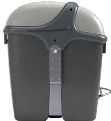
TRAFFIC GREY RAL 7043