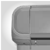
GREY RAL 7037