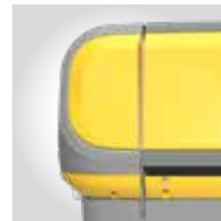
YELLOW RAL 1018