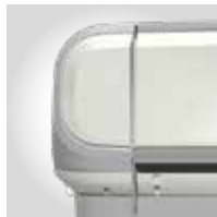
LIGHT GREY RAL 7038