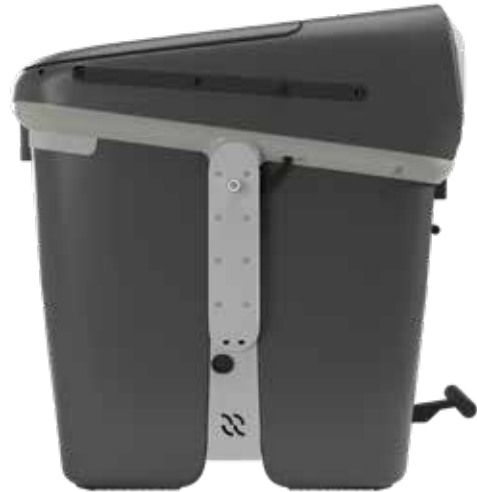
TRAFFIC GREY RAL 9005