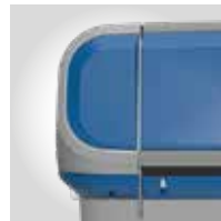
BLUE RAL 5005