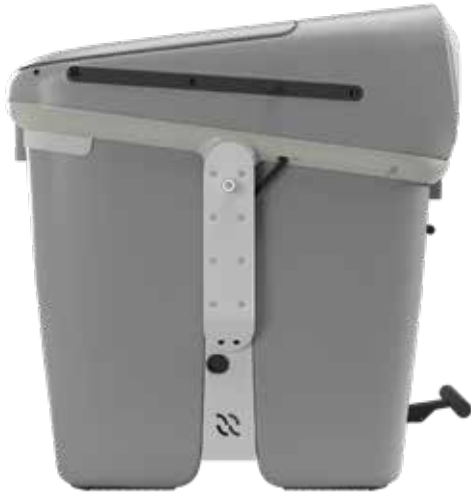
GREY RAL 7037