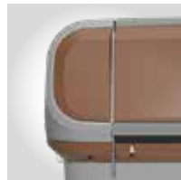
BROWN RAL 8024