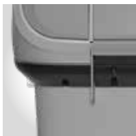
DARK GREY RAL 9005

Colours may vary due to production. The colour values given according to RAL are guide colours.