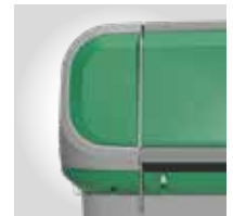
GREEN RAL 6032