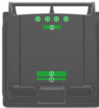
Top view Standard Mono lid