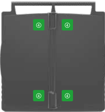
Top view Butterfly lid 50/50