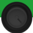
300 mm wheel