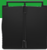
Butterfly lid 50/50