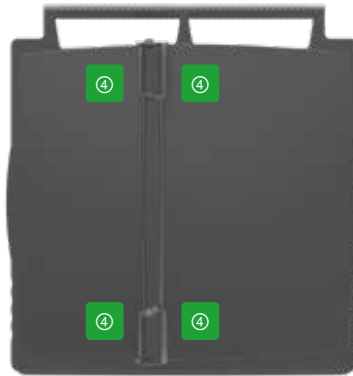
Top view Butterfly lid 40/60