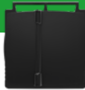
Butterfly lid 40/60