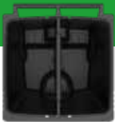
Dividing Wall 50/50