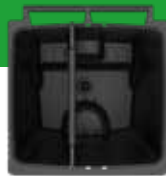
Dividing Wall 40/60