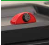
Cylinder lock with automatic function