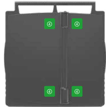
Top view Butterfly lid 60/40