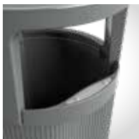
Cigarette extinguisher basket