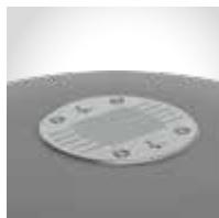
Cigarette extinguisher lid