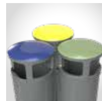
Fraction labelling with colored lids