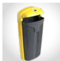
Fraction labelling with colored lid / structure type