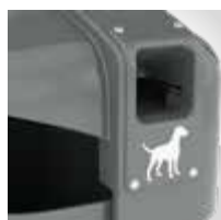
Canine bag dispenser