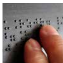
Braille blind touch device, with waste type