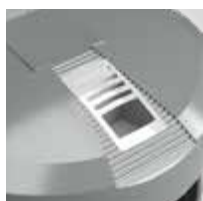
Stainless Steel Ashtray