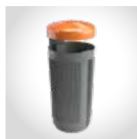
Fraction labelling with colored lid