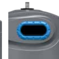
Paper Sky Blue RAL 5015