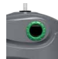
Glass RAL 6010-6018