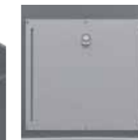
Big user Flap