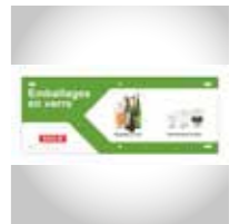
Sorting out instruction (example)