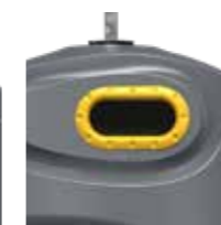
Packaging Zink Yellow RAL 1018